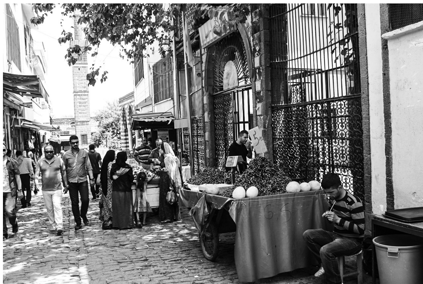
Figure 2.1 Street life in Sur, Diyarbakır, June 2015.

some guidebook-worthy sites and some urban regeneration, the narrow, cobbled lanes of Sur retain a ramshackle air and highly visible pockets of poverty. Sur also reveals some of the demographic diversity among Kurds, being meeting place for the well-off, who go for brunch in hip kahvaltı salonları (breakfast salons), workplace for municipality staff, shop owners and bazaar stall-holders, as well as home to villagers who fled the conflict in the surrounding countryside in earlier decades. 4 In Sur I moved between a maze of shops and teahouses around the Ulu Cami and nearby neighbourhoods, encountering people from these diverse demographics. In an attempt to diversify the range of views I encountered, I also spent time in the Ofis neighbourhood of Yenşehir (literally 'New City') outside the city walls. This is the city's commercial and administrative centre, a neat grid of streets, with broad footpaths, modern shopfronts, apartment and office buildings. The atmosphere here is noticeably more affluent than in Sur. Those I met here were from the professional classes – teachers, bureaucrats, journalists – and all were tertiary educated.