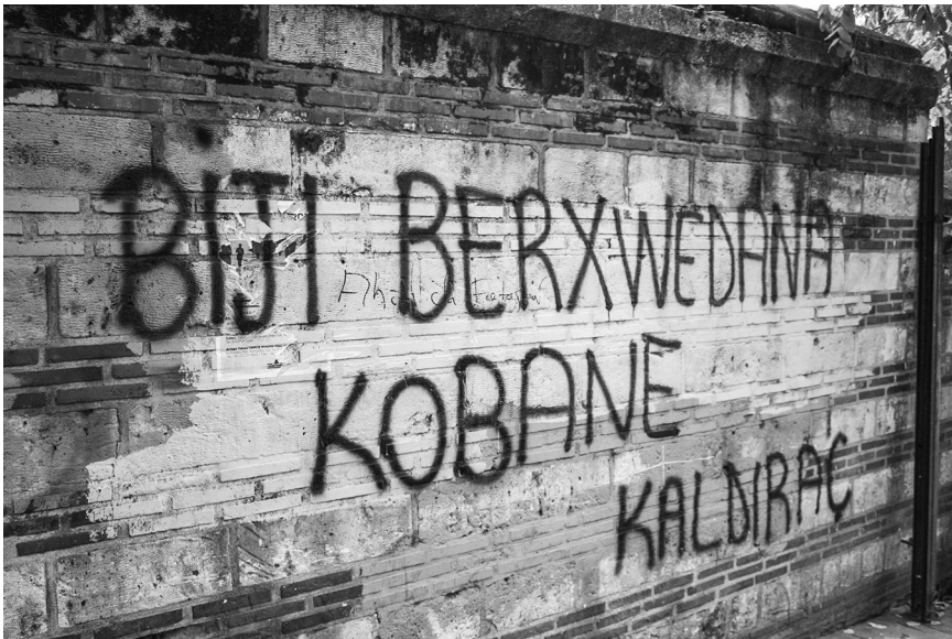
Figure 6.1 Graffiti in Kadıköy, Istanbul, November 2014. It reads, in Kurdish, ‘Long live the Kobanî resistance’.

Kobanî therefore constituted an event that catalysed ‘groupness’, an instance where solidarity was magnified – as Simmel’s rule dictates – by external pressure. In this era of global communication and media coverage, Kobanî