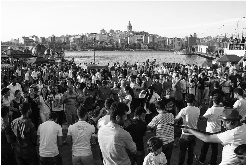
Figure C.1 Kurds dance the govend in Eminönü, Istanbul, following the HDP's electoral success in June 2015.

Such elation resulted from winning a record number of seats in the assembly and, into the bargain, depriving the AKP of its majority and – temporarily – Erdoğan of the opportunity to introduce his presidential model. Kurds had made their presence felt and, best of all, won representation in parliament – they had carved out a political space, despite the risk of failing to pass the threshold and losing all representation, and in the face of considerable hurdles, including harassment and terror attacks. The election results meant that they were in a position to have a say in the running of the country, to be able to shape and contribute to debates and policies that would determine the political trajectory that Turkey pursued. This suggests that while the Kurdish struggle is one for a political identity – the freedom to participate within politics, within the ‘daily plebiscite’, on equal terms, on their own terms – it is at the same time a struggle for political input . Rather than a struggle that is carried out in its entirety under the banner of Kurdishness, it is a struggle carried out to have a say in the running of the country, to participate in its reshaping and redefinition.