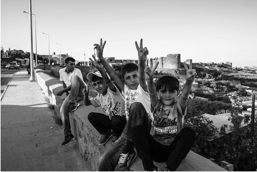
Figure I.1 Kurdish boys outside the walls of Diyarbakır, June 2015.

speak of Turkey’). She argues there is an ‘Istanbul-centric’ assumption that decrees that Istanbul is the automatic first choice and quintessential location for social and political research conducted in Turkey. 36 Hart concedes, and I concur, that Istanbul is of pivotal importance, but restricting research to the city means a less detailed and less comprehensive picture of modern Turkey. This is particularly so regarding Kurdish life and politics, much of which is conducted in the south-east of the country. To this end, my choice of Diyarbakır is intended to raise the analytical gaze from Istanbul, to extend it to the south-east and afford another piece of research that contributes to a broader view of the country as a whole.