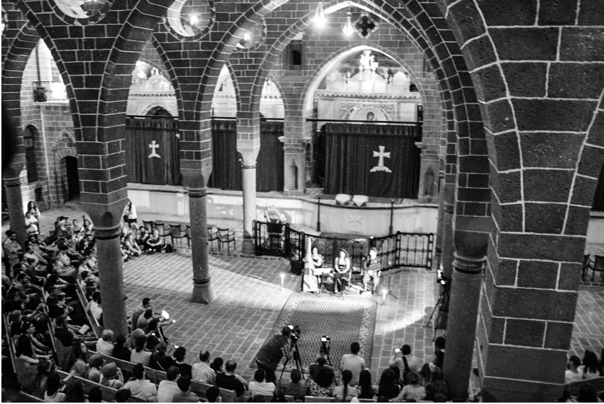
Figure 4.1 Performance of Kurdish, Turkish, Armenian song, Cathedral of Surp Giragos, Diyarbakır, June 2013.