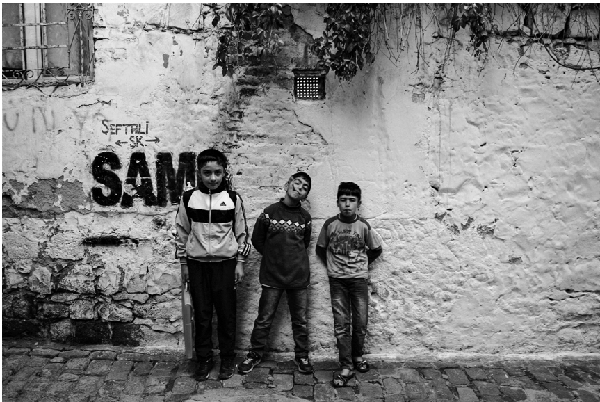
Figure 2.2 Kurdish boys in the backstreets of Diyarbakir, October 2014.

It is notable that at the time of my research trips, between 2013 and 2015, Turkish politics was eventful but less polarised and less on edge than it has been in recent years. While I encountered some people unwilling to