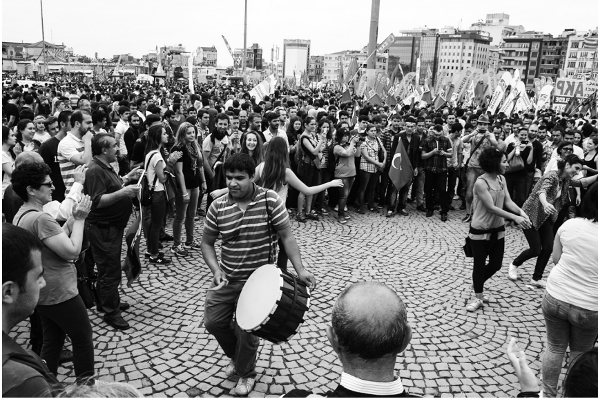
Figure 1.1 Dancing during the Gezi Park protests, Istanbul, June 2013.

societal norms. 84 This may be seen as the continuation of the notion, stemming from the disruptions and ethnic fragmentation of the late-Ottoman era, that strength is found in unity, and that disunity leaves one open to exploitation, at the mercy of opponents intent on your defeat. But during the Gezi protests the population looked beyond differences, highlighting what they shared in the face of what they saw as the government's unjustifiably heavy-handed responses to initially peaceful protests in Istanbul and beyond. Temelkuran contended that Gezi demonstrated that citizens of Turkey from across the political spectrum could 'co-exist against all odds'. 85 In this sense, a long-standing propensity towards conformism evident in Turkish society was subsumed and, as one journalist observed, 'governing enmities seemed to have been overthrown'. 86 An image widely shared on social media showed two youths holding hands while running from a police water cannon barrage. 87 One of the youths carried a flag depicting Atatürk, an indication of support for the Kemalist-inclined Republican People's Party (CHP); the other carried the banner of the pro-Kurdish Barış ve Demokrasi Partisi (Peace and Democracy Party; BDP). These are two diametrically opposed positions. According to long-standing political orthodoxies, they are not supposed to or assumed to ever hold hands, but here they cooperated in the face of the onslaught of the state security apparatus.