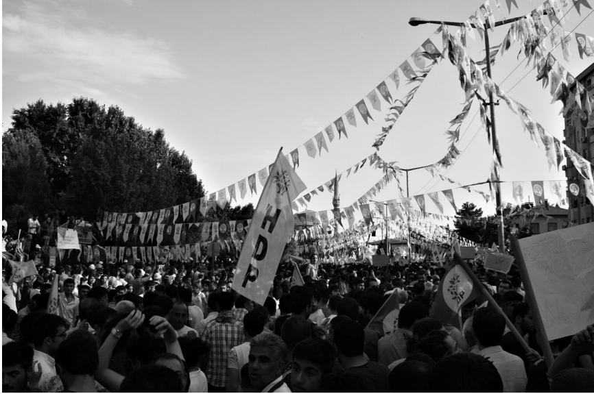
Figure 7.1 Crowds gather at the HDP rally, Diyarbakır, 5 June 2015.

Reflecting Turkey's tense geopolitical circumstances, two explosions – bombs planted by ISIS – disrupted the HDP rally, dispelling the carnival atmosphere. The rally was abruptly called off. The crowd fled in panic and rushed the wounded to hospitals. Four people were killed. Returning days later to the site of the blasts, I saw that locals had created a makeshift shrine decorated with balloons, flowers and handwritten notes. While I was present, pedestrians gathered and cars slowed to observe. The traffic ground to a halt and car horns sounded. Initially I thought this was the frustration of commuters being held up, but then I realised that bystanders at the makeshift shrine were facing the traffic and making the peace sign; those in cars were doing the same. Amid a growing chorus of horns, people faced each other, holding each other's gaze, raising their heads proudly. This was not a traffic jam, but a powerful gesture of solidarity and defiance on a gritty street corner where Kurdish lives had been taken. It was serhildan in action: people raising their heads in defiance and in a statement of presence.