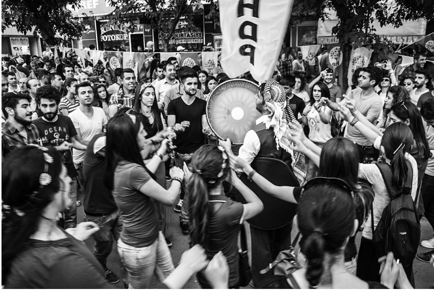
Figure 8.1 Dancing at HDP rally, Diyarbakır, 5 June 2015.