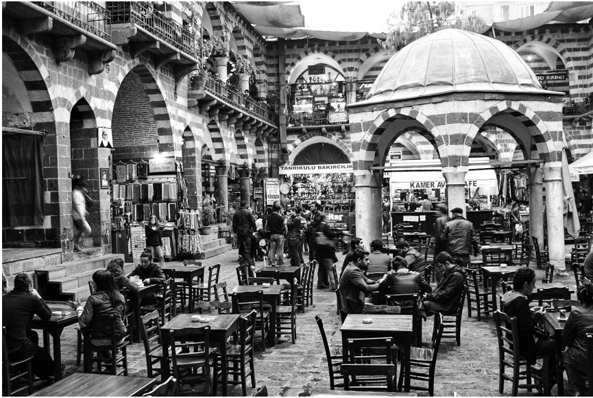
Figure 5.1 The Hasan Paşa Han, Diyarbakır, November 2014.